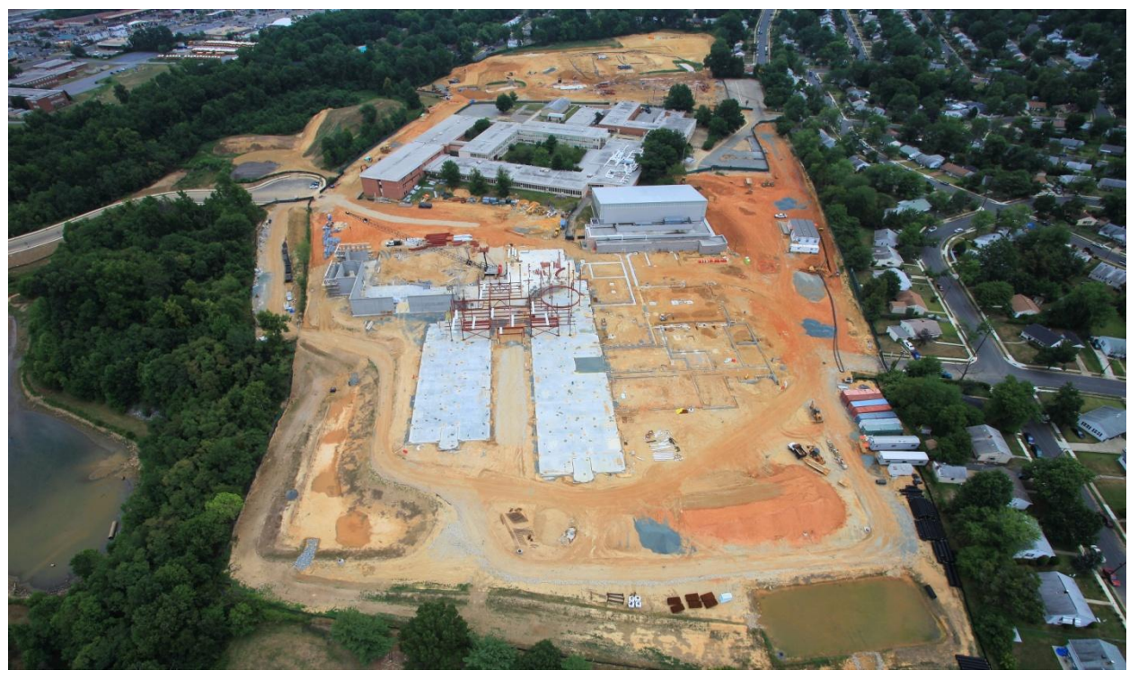
Figure 1: Progress Photo 07/14/2012

The demolition of the existing school will start after the new building is turned over to the owner and the space has been occupied in August of 2013. After the building has been removed a permanent parking lot and bus loop will be installed. It is also during this time that the sports fields will be completed.